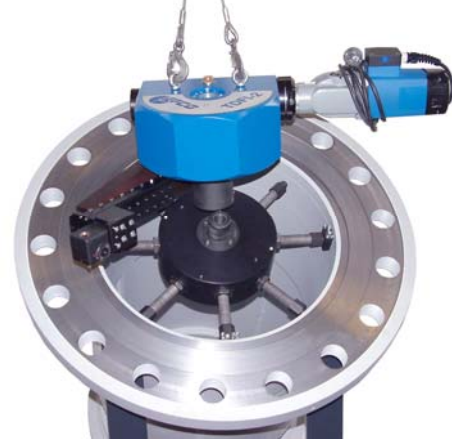
Fitting the gearbox housing

Choice of electric drive or compressed air drive motor.