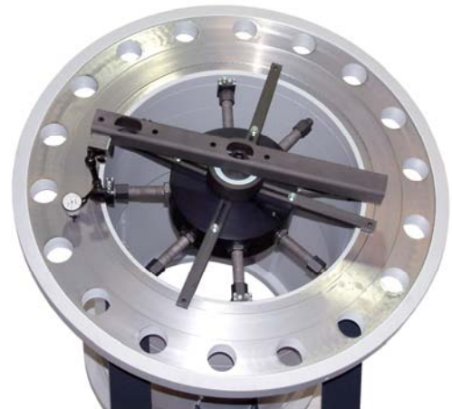
Inserting and aligning the clamping device

The straightforward design of the clamping device allows for easy installation and alignment within a short period of time.